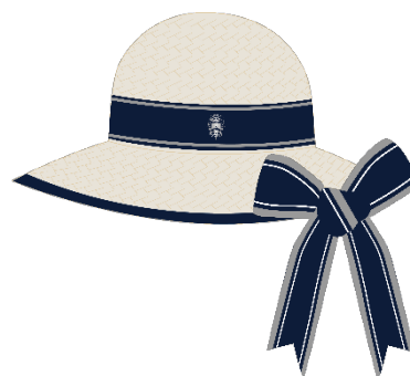
HAT & HAIR ACCESSORY