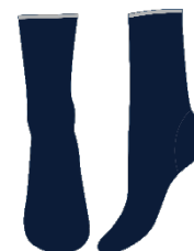
NAVY SCHOOL SOCKS OR FRENCH NAVY TIGHTS