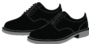
BLACK SCHOOL SHOES OR IDAHO T-BAR SCHOOL SHOES