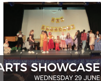
PRIMARY ARTS SHOWCASE WEDNESDAY 29 JUNE